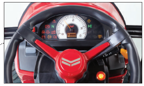
Convenient controls include standard auto throttle