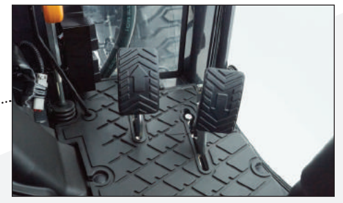
Side-by-side forward/reverse pedal