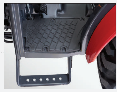
Flat, walk-through floor and large, anti-slip step