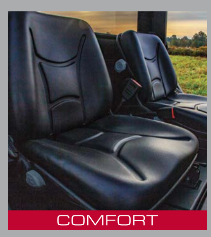
Built to provide ample space for its passengers, our seats come equipped with adjustable slide, tilt, and lumbar support.