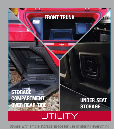
from tool boxes to hunting gear, including under-seat storage options.